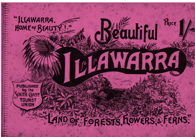
South Coast Tourist Union, The Illawarra or South Coast tourist guide (1899).