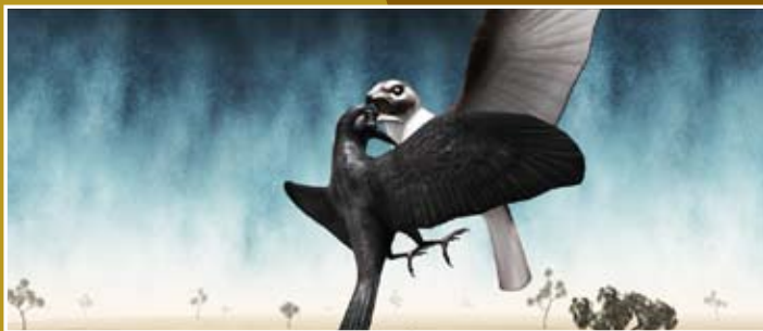
Yanyuwa Songlines Project